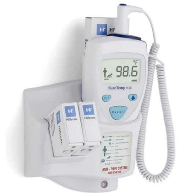
1 Digital Thermometer for each Community Health Center