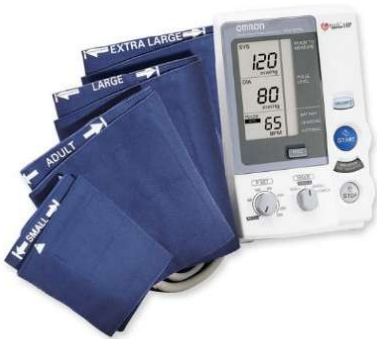
1 Blood Pressure Monitor for each Community Health Center

Based on her guidance and your generous support, FOIII has just approved grants for the following two diagnostic items in each of the island's six Community Health Centers as part of the Nevis government's Hearts Program to help residents with chronic, non-communicable diseases to manage their conditions, promoting early detection and improving treatment outcome: